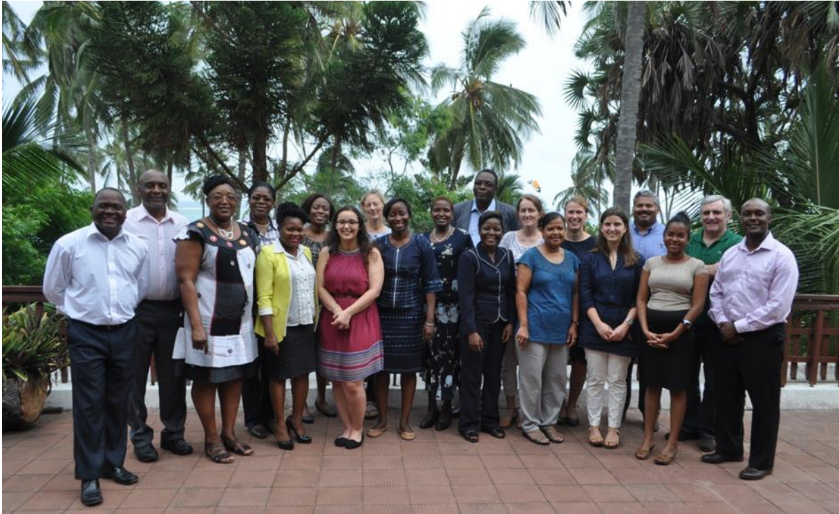
Fifth project management team meeting, Mombasa, Kenya, January 2016