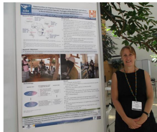
MOMI session at the Integration for Impact Conference, Nairobi, September 2012 and Health Systems Research Symposium, Cape Town, October 2014