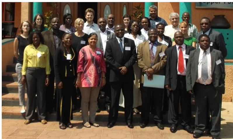
Fourth project management team meeting, Lilongwe, Malawi, September 2014