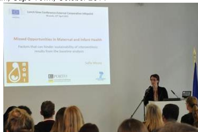
International Conference on Realist Approaches to Evaluation and Synthesis, Liverpool, October 2014 and EUROPEAID InfoPoint lunch-time Conference ‘Rethinking development & EU Aid: a focus on Reproductive Health’, Brussels, April 2015

In June 2015 the MOMI paper with as title ‘ Opportunities to Improve Postpartum Care for Mothers and Infants: Design of Context-specific Packages of Postpartum Interventions in Rural Districts in Four sub-Saharan African Countries ’, was published in the peer reviewed journal ‘ BMC Pregnancy and Childbirth ’. In January 2016 the paper titled ‘ A review of factors associated with the utilization of healthcare services and strategies for improving postpartum care in Africa ’ was published in Afrika Focus . Consortium partners are finalising drafts of papers to be published in peer-reviewed journals. Dissemination of project progress and research results ( work package 10 ) was also done through the distribution of the MOMI newsletter (two issues per year), local media, policy briefs and the MOMI website. At the end of the project, 22 nd January 2016, a one-day international MOMI conference was organised in Mombasa, Kenya. During this conference the MOMI project findings