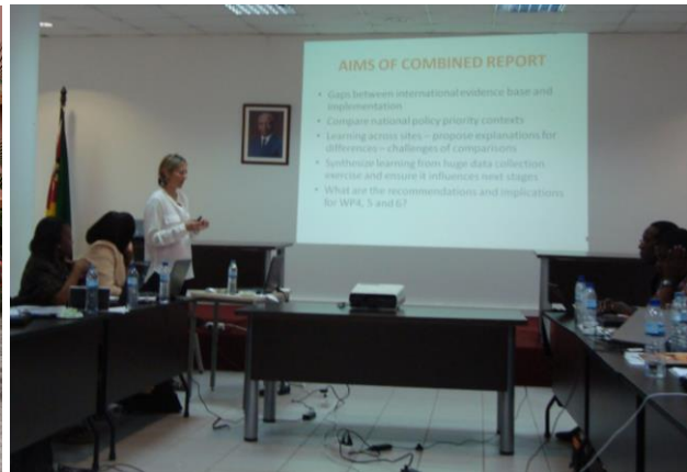
Third project management team meeting, Maputo, March 2013