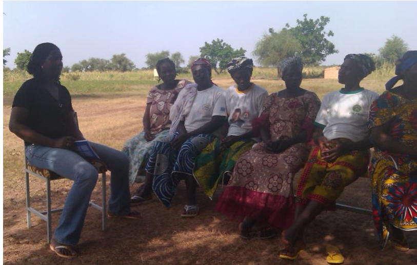
Implementation of postpartum interventions in Kaya district – The facility health worker meets with community health workers to discuss provision of postpartum care at community level, October 2013.