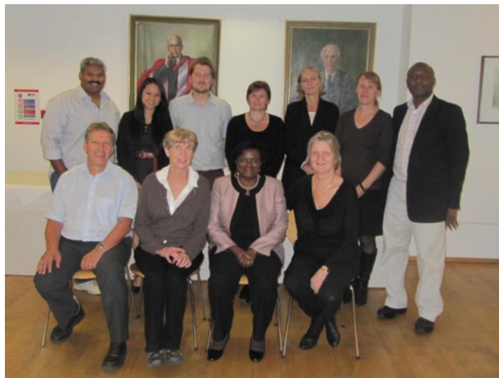
Scientific advisory board meeting, London, October 2012

These workshops revealed observations and findings, which, together with the input from work packages 2 and 3, fed the design of context-specific packages of interventions to be implemented in the four African sites ( work package 4 ). As part of work package 4, country reports were developed. These reports combined the main findings of the baseline postpartum care assessments resulting from the analyses of work packages 2, 3 and 9 and provided, based on these main findings, a list of feasible context-specific interventions having the potential to improve postpartum care and services at the four study sites. In autumn 2012 these reports were distributed among each country's maternal, newborn and infant health key stakeholders and among the MOMI policy advisory board members in order to be used to define and agree on the package of postpartum interventions. A meeting between the project management and the scientific advisory board members took also place in autumn 2012. The objective of this one day meeting was to receive advise of the scientific advisory board members on how to optimise postpartum care in our four study sites.