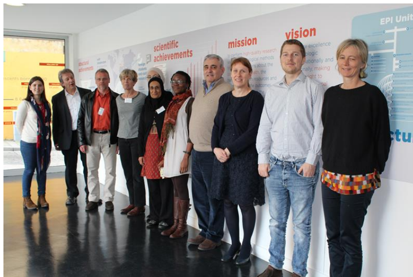
Scientific advisory board meeting, Porto, March 2015

Reflecting on the baseline process evaluation experiences, the evaluation tools were refined for their use at the end-evaluation. Inputs from the scientific advisory board members on how to optimise the end-evaluation tools were received during the scientific advisory board meeting that took place in March 2015.