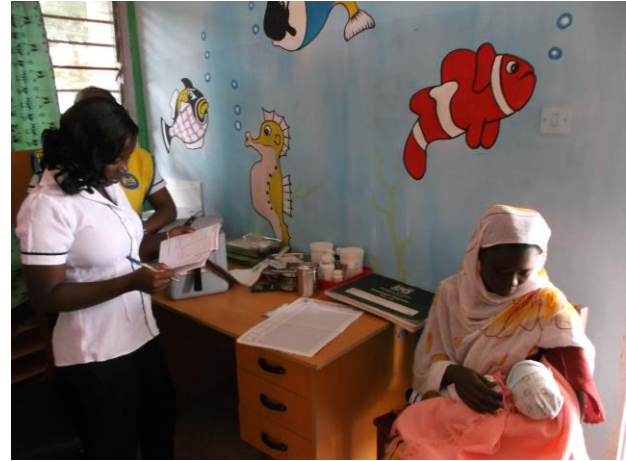
MOMI project interventions: community based postpartum intervention in Kaya district, Burkina Faso and facility based MOMI supported PPC in Matuga sub-county, Kwale district, Kenya, 2014

Reflecting on the baseline process evaluation experiences, the evaluation tools were refined for their use at the end-evaluation. Inputs from the scientific advisory board members on how to optimise the end-evaluation tools were received during the scientific advisory board meeting that took place in March 2015.