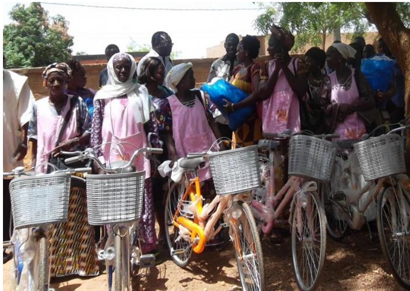
Community health workers in Kaya district, Burkina Faso received bicycles to enhance their MOMI work, May 2014.

Based on the selected interventions, process evaluation methods and tools ( work package 6 and 7 ) and tools and indicators needed to conduct pre-/post evaluation ( work package 6 ) and monitoring ( work package 5 ) were defined and developed. To enhance the intervention implementation, apart from the regular locally organised supervision, the MOMI partners from the north visited twice a year each of the MOMI implementation sites to discuss with the local MOMI researchers and stakeholders implementation challenges and find together solutions for observed obstacles and barriers.